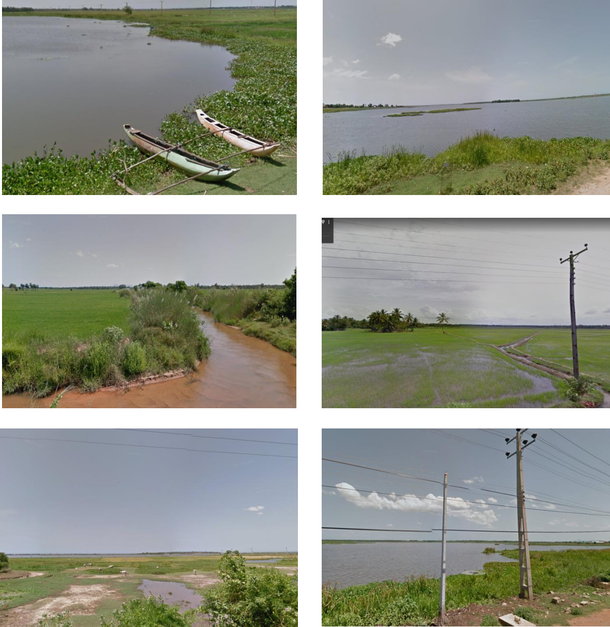
Figure 3. Field survey, 2017

The employment types in Navithanveli DS Division are agriculture, business, service sector and other as 80%, 15%, 4% and 1% respectively. As an agricultural area, Navithanveli is extensively engaged. Majority of the wetlands are used for the paddy cultivation.