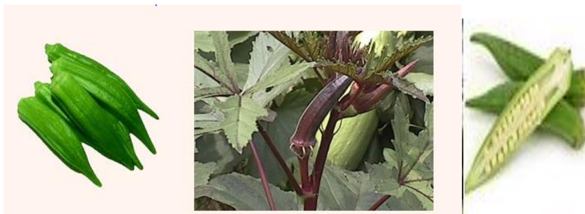
Figure 2. Okra Pod and plant

Irritating hairs are sometimes present on the leaves and stems and traces of alkaloid have been reported in leaves. Leaves and fruit have been used as a medicine for relieving moisturize skin, prevent scurvy, induce seating, treating urinary disorders in many countries. Okra mucilage has been used as a plasma replacement and blood volume expander. Okra bark