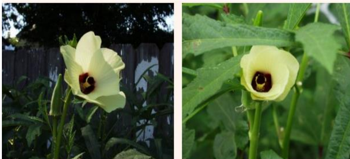
Figure 1. Flowers of Okra ( Abelmoschus esculentus )

The seeds of okra have a lower content of calcium, magnesium and potassium in comparison to leaves as reported [2]. The superior fiber found in okra helps to stabilize blood sugar as it curbs the rate at which sugar is absorbed from the intestinal tract. Okra's mucilage not only binds cholesterol but bile acid carrying toxins dumped into it by the filtering liver