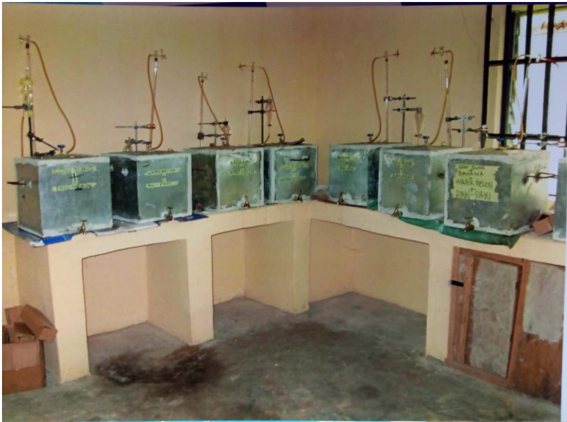
Photo 1. Anaerobic digestion in progress

Water melon peel (W), Paw-Paw peel (P), and Banana peel (B) were sorted and put into different mortar and pounded into pulp, except the cow dung (C) which was cured and sterilized for 2 weeks before used. The digestion was operated using the principle of anaerobic digestion by mixing the substrates at a ratio of 1:3 (substrates weighed 13 kg and water 39 kg (w/w)) which gave 36 litres and placed in different digester, as shown in Photo 1 .