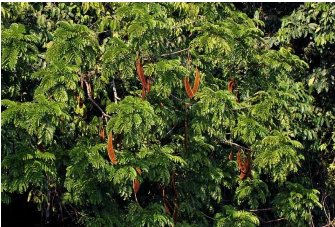
Figure 1. Mistletoe on oil bean tree ( Pentaclethra macrophylla )

Viscum album leaves were harvested from Pentaclethra macrophylla within the month of October, 2016. The harvested Viscum album leaves were identified at the Department of Plant Science and Biotechnology, Imo State University, Owerri. The dust particles on the samples were cleaned by washing them with deionized water. Samples were air-dried for two weeks, pulverized into fine powder using pestle and mortar, and stored in a previously cleaned plastic bottle in a refrigerator.